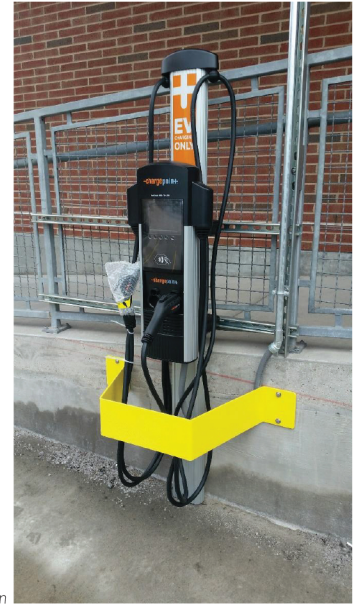
Typical installation shown