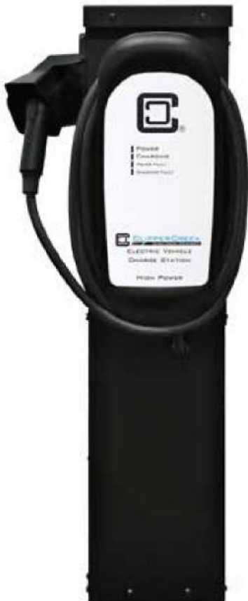
PMD-10R with HCS -60

The PMD-10R is an affordable solution designed for fleet, parking lot, or any harsh environment. Designed to accommodate ClipperCreek HCS, LCS, ACS products as well as the Tesla® Wall Connector. This "ruggedized" mounting solution is an excellent value