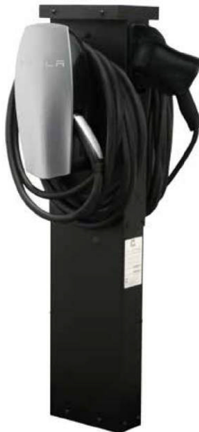
HCS/TESLA® Combo PMD-10T

The PMD-10T has all the same features as the PMD-10, but comes equipped to mount ClipperCreek and/or Tesla® charging stations.