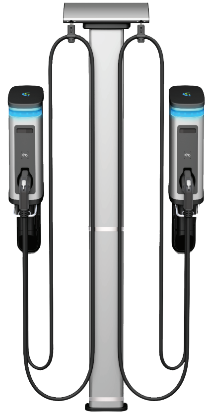
Shown wall mounted with optional cable management system.